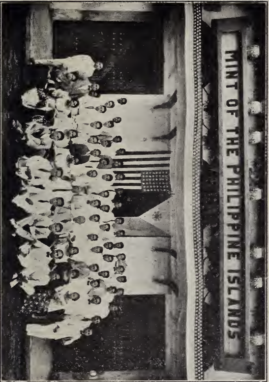
Officials and Employees of the Mint